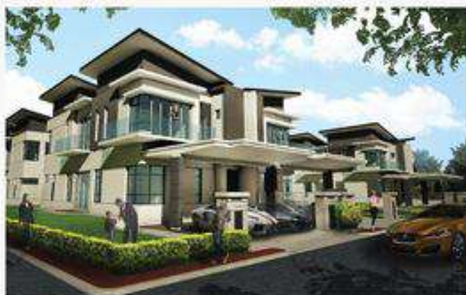
Opal (Amber) | 2-storey Semi-Detached House