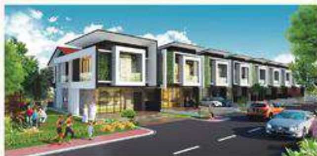
Crown Series | 2-Storey Terrace House

• Free Legal Fees and Stamp Duty on SPA • 10% Rebate