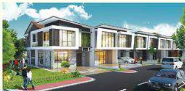
Tiara Series | 2-Storey Terrace House