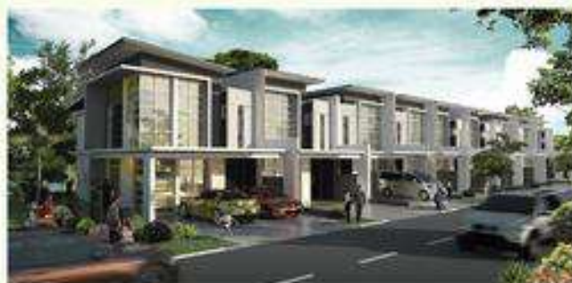
2-Storey Terrace House