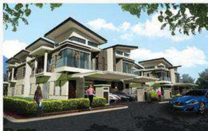
Opal (Ivory) | 2-storey Cluster House