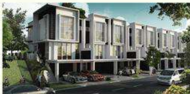
3-Storey Terrace House