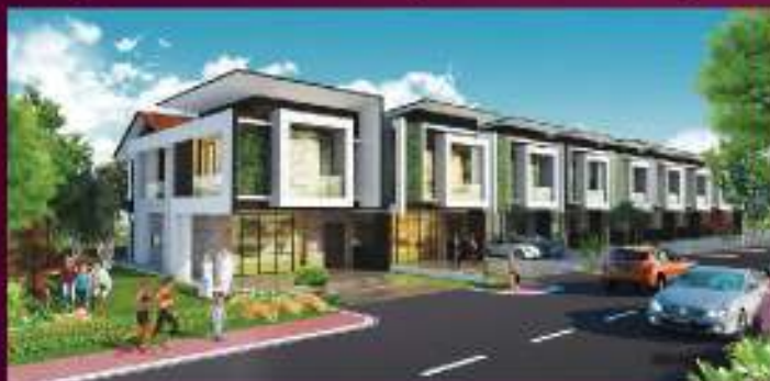
Crown Series | 2-Storey Terrace House

Emerald Residenz, luxurious double-storey superlink homes in Bandar Seri Alam, comprises of the Tiara and Crown Series. This lifestyle development is set in a low-density enclave surrounded by scenic amenities complete with 24-hour gated and guarded community.