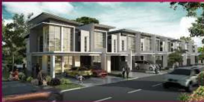
2-Storey Terrace House

Promises an opulent lifestyle in one of Johor's best suburban enclaves, Imperiale Jade Residenz presents 241 units of two and three-storey terrace house ranging from 1,623 sq.ft. to 1,851 sq.ft. Featuring 4 bedrooms and 3 bathrooms, the residences offer innovative interior layouts that are practical yet stylish. Surrounded by lush greenery, the gated and guarded development includes trained security personnel for a peaceful sanctuary.