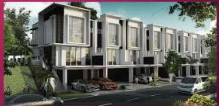
3-Storey Terrace House