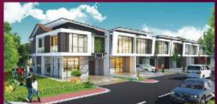
Tiara Series | 2-Storey Terrace House