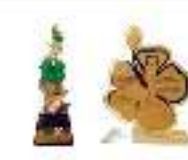
PRIME MINISTER'S HIBISCUS AWARD